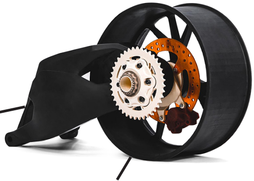
Motorbike Wheel 2 days at 100µm Resin: Hard Black