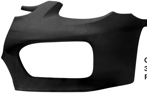
Car Bumper 3 days at 100µm Resin: Hard Black