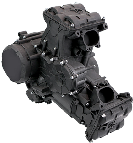
Motorbike Engine 2 1/2 days at 100µm 6 parts printed on same platform and assembled. Resin: Hard Black